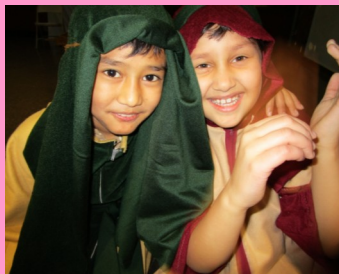
Joseph and the Innkeeper

40 new winter coats and 40 gift cards for new shoes/boots were received by House of Mercy regular participants. Thanks to your financial support our youth will be warm and healthy as they walk to school in the winter months.