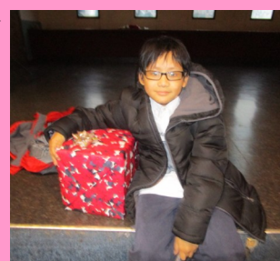
All shopped out!

St. Martin Center provided gifts for 71 elementary youth. Mercyhurst Prep School sponsored all our middle and high school youth so they would not be forgotten. They provided over 50 gifts and McDonald's certificates to be used as incentives throughout