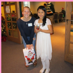
Enjoying Miracle on 38th St.

2015! They also sponsored a Christmas party for our youth. One teen said, "It was the best party I ever went to."