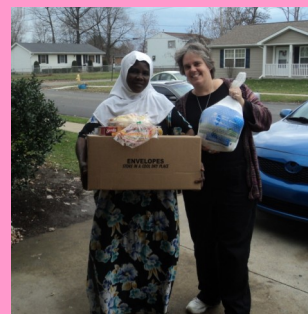
A satisfied customer!

Those who participated in our annual Christmas Play received an educational toy from all of our donors.